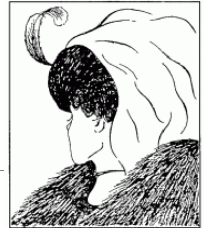
What do you see? By shifting perspective you might see an old woman or a young woman.